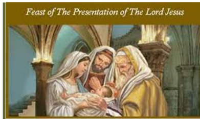
Feast of The Presentation of The Lord Jesus

Adoration of the Blessed Sacrament: Thursdays 7—8pm