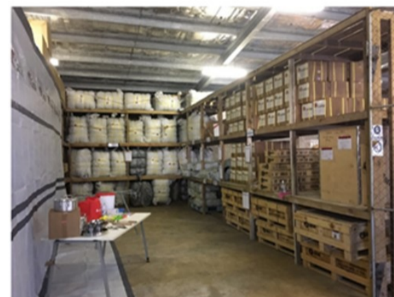
The funds raised will be used to provide immediate and longer term assistance through Caritas Tonga.

Visit www.caritas.org.au/donate/emergency-appeals/pacific or call 1800 024 413 toll free to make your donation.